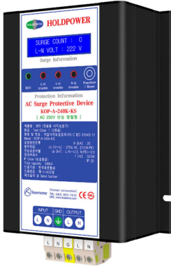
Model List B-1 (W)140 x (L)216 x (H)70