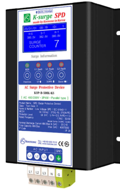
Model List B-2 (W)140 x (L)216 x (H)90