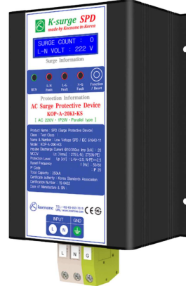
Model List A-3 (W)140 x (L)226 x (H)90