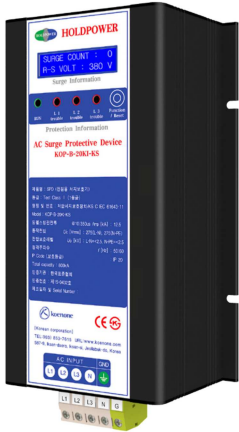
Model List A-2 (W)140 x (L)276 x (H)90