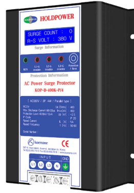
Model List C-2 (W)140 x (L)190 x (H)90