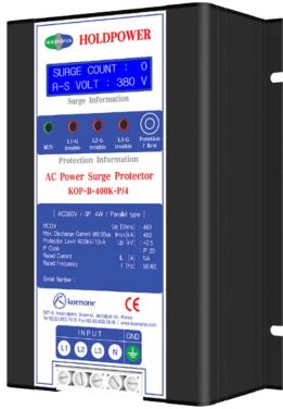
Model List C-1 (W)140 x (L)190 x (H)70