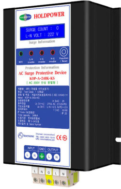
Model List B-1 (W)140 x (L)216 x (H)70